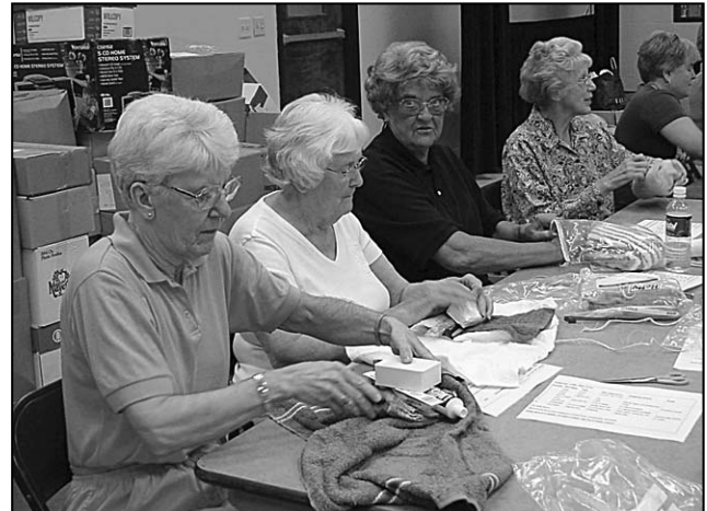
A Western PA Conference image

The 48,000-square-foot warehouse in Mechanicsburg provides space to store supplies donated from Central PA and other Conferences and for volunteers to process and distribute them. The initial $2 million debt on the